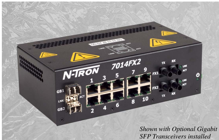
Shown with Optional Gigabit SFP Transceivers installed

Port Mirroring - This function allows the traffic on one port to be duplicated and sent to a designated mirror port. Port mirroring can be used to monitor Ethernet traffic on the designated source port using the assigned mirror port. In addition, SNMP, COM port, and Telnet interfaces are available for switch link and status monitoring.