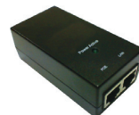
PoE Injector A

4 Connect the PoE Injector to an appropriate power source.