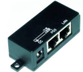
PoE Injector B (x 2)