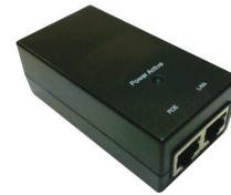
PoE Injector A (x 2)