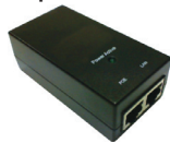
PoE Injector A

For installations with AC power available